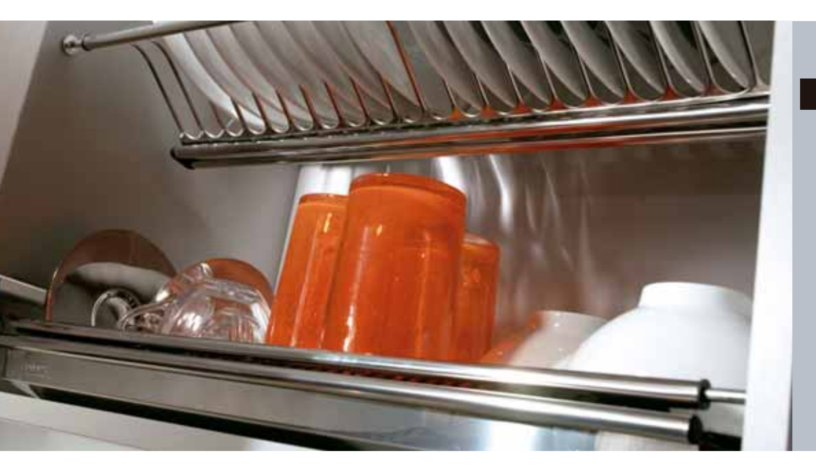
PLATE-RACK IN STAINLESS STEEL WITH GLASS-RACK, AND DRIP TRAY.