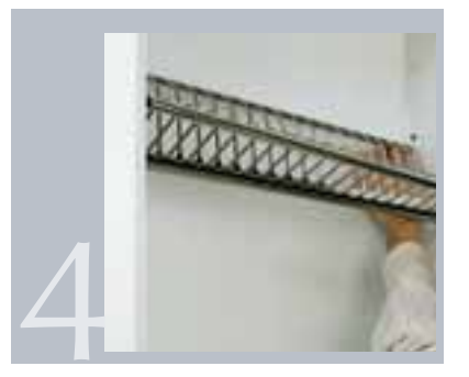
PROCEED TO FITTING THE PLATE-RACK. PRESSING THE LOCKING LUGS, THESE WILL BE RETRACTED AND EASILY FITTED IN THE MODULE DRILLINGS.